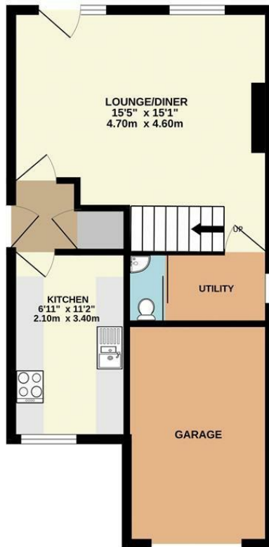
GROUND FLOOR 444 sq.ft. (41.3 sq.m.) approx.